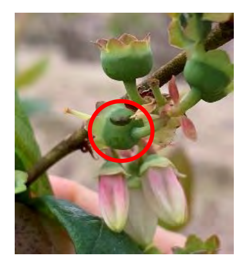
Figure 1. Fresh plum curculio egg scar on young fruit.

Botrytis, Phomopsis and Mummy Berry Strikes: Disease has still been very minimal in the fields. Most disease incidence levels are only showing up on 0.5% of bushes.