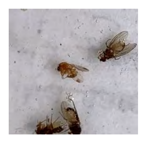
Figure 2. Adult male SWD (center) from trap capture. (Photo - Carrie Denson).