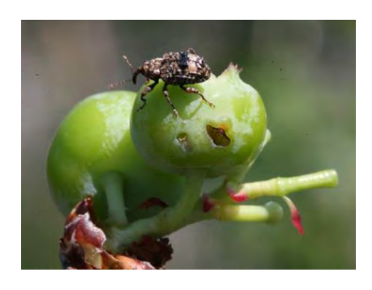
Figure 1. Plum curculio adult and oviposition scar.

Botrytis, Phomopsis and Mummy Berry Strikes: Very little disease has been seen. Botrytis is present (Figure 2), but the highest levels seen have only been a few clusters on .5% of plants examined. Nevertheless, this disease can spread fast if given cool wet conditions like we are supposed to have later this week. See suggested fungicides in the Blueberry Production Guide.