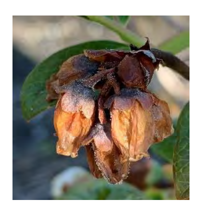
Figure 2. Botrytis infection developing on blossoms.