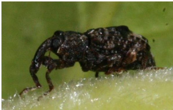
Figure 1. Plum curculio adult. Note the rough, warty body appearance.

Adults become active during bloom and feed on young fruit just after bloom, causing feeding scars. We have noticed that in the absence of fruit (i.e., this time of year), adults feed on blueberry flowers (petals). Females lay eggs in the fruit causing crescent-shaped oviposition scars. White maggot-like larvae develop inside the fruit (one larva per fruit). Feeding by the larvae causes fruit to develop prematurely and fall off the bush. Mature larvae exit the fruit to pupate in the ground, and become an adult in July and August. If berries are picked before they drop, larvae can contaminate harvested fruit.