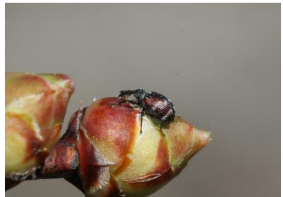
Picture 2: Cranberry Weevil on a blueberry flower bud.