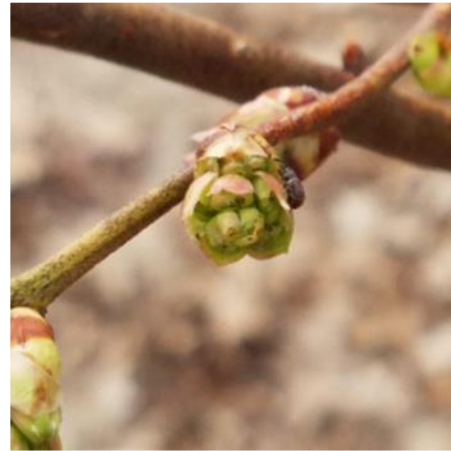
Picture 1. Cranberry weevil and damage to blueberry buds this past week.

Scouting and Control: To monitor adults, use a beating tray under each bush and hit the bush to dislodge weevils; repeat on both sides of the bush to obtain number of weevils per bush. Because weevils are abundant near the woods where they overwinter, sampling for weevils should be intensified along the edge rows near the woods. Adults are found on sunny days. Monitor at least 10 bushes per sample site. Spraying should be confined to these “hot” spots on edge rows. Treatment thresholds are 5 weevils per bush or 20% of blossom clusters with feeding injury (i.e., at least 1 injury/puncture per 5 clusters) (see Picture 1). Asana, Avaunt, Imidan, or Mustang Max are recommended for cranberry weevil control.