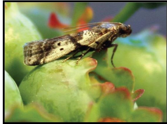
Adult cranberry fruitworm

Esteem and Rimon do not touch PC. The pyrethroids ( Bifenture, Brigade, Danitol, Hero, Mustang) will control low populations of PC, but are not ‘high PC pressure materials’. Exirel will control both pests