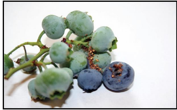
Cranberry fruitworm damage to developing fruit

Aphids: Aphid populations are close to what they were the previous week – averaging about 4% infested shoots, with a maximum of 22%. Overall aphids are not a target, except under a few extreme cases.