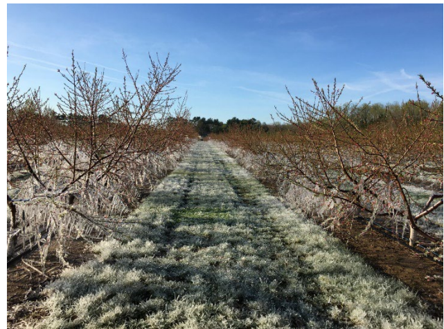
Figure 4.6 Frost Protection Using Under-Tree Sprinkler Irrigation in Peach Orchard in DE.

Under-tree sprinkler systems work on the same principle as overhead systems, but with a reduced scope of coverage since they only cover the lower canopy and soil underneath the tree (Figure 4.6). In addition, under-tree sprinkler irrigation may also be used to increase heat transfer from the ground to the air if used according to the same principles as outlined for drip irrigation (see below). If used also for irrigation, it becomes cost-effective. Most systems use small (5/64" – 3/32") low trajectory sprinkler heads operating at 40-50 psi. There are main hoses on each side of the tree, and each micro-sprinkler has a little tube inserted into that hose. Applications range from 0.08-0.12 inch/hr. An application of water at 69.8°F has been used in Mexico and WA using a large boiler located at the side of the field. This additional cost to heat the water has to be added to the cost-effectiveness equation of this system. This under-tree system may be preferred over another irrigation delivery system when well or pond capacity is limited. It uses much less water compared to the overhead system but with lower effectiveness, particularly for mature trees.