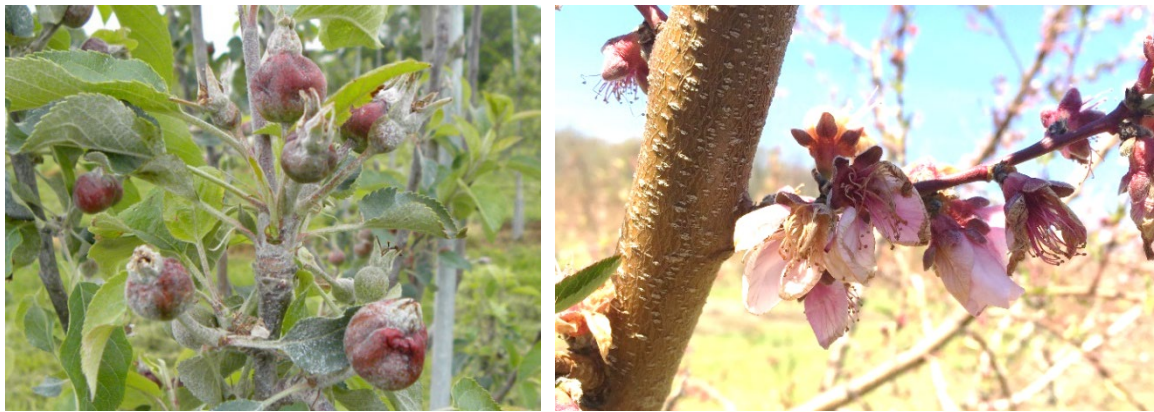
Figure 4.1 Frost Damage in Apple and Peach Bloom

Active FP methods are costly, and only highly effective when used properly. Frost damage occurs when plant tissues are exposed to subfreezing temperatures (Figure 4.1). However, it is the co-occurrence of other factors that determines the extent of the damage. The following plant and environmental conditions should be monitored. Thorough knowledge of the prevailing conditions in the orchard will help determine which FP method to employ and for how long.