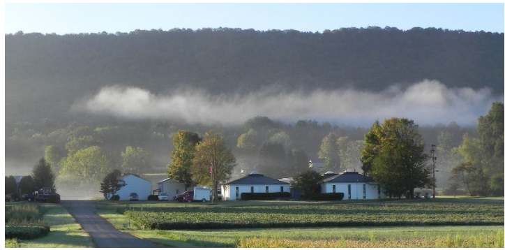
Figure 4.2 Strong Inversion Layer over a Field in Pennsylvania

An inversion occurs when a layer of the atmosphere higher in altitude is warmer than the atmosphere lower or close to the ground (Figure 4.2). This is a reversal of normal temperature behavior. A strong inversion layer can be a source of relatively warm air that is above the colder air, and trapping the colder air close to the ground in the tree canopy. For this reason, inversions need to be closely monitored.