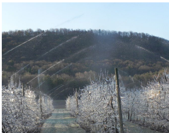
Figure 4.4 Frost Protection Using an Overhead Irrigation System in the High Density Apple Orchard in PA.

Pros: Overhead irrigation doesn't produce noise or air pollution as compared to other methods, and it can also be used for summer irrigation. This method will provide FP down to 22°F with no wind or 24-25°F with a slight wind (Longstroth, 2012). Very few methods can achieve a level of FP to this temperature. This system has low energy consumption when compared to other methods, however, one needs to consider the energy used to pump the water from its source. Operational costs per acre for overhead irrigation are low compared to other methods.