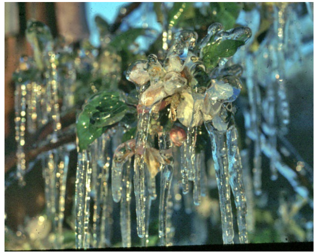
Figure 4.5 Example of Continuous Ice Formation over Apple Tree Using Overhead Irrigation Clear ice and non-cloudy layer indicate successful FP (Photo by R. Crassweller).

One way to address the challenge of needing a substantial amount of water is to use overhead micro-sprinklers . This method targets mostly the canopy, and as a result, one has better control over the coverage. This system uses about 35-40% less water per acre, and the savings in energy costs are roughly half of overhead irrigation (Rieger, et. al, 1990). However, the installation cost could be higher than the overhead impact sprinklers. This system requires a trellis to support half-inch polyethylene laterals. However, since new high-density orchard plantings already use trellising for training young trees, these can also be used to support the installed micro-sprinklers. To prevent clogging, of nozzles by sediments, install a filter at the start of the system ; and for maintenance add a valve at the end of each supply line that also allows for repair of the supply line while the rest of the system is on.