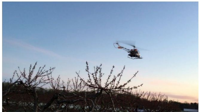
Figure 4.9 Frost Protection Using a Helicopter in Fifer Orchard, Delaware

Cons: Service may not be readily available, and pilots may experience dangerous operating conditions due to poor visibility and orchard terrain. Varying degrees of success have been reported with air mixing via helicopters. If there is no inversion layer, this method is ineffective. The service provider may also ask for holding fees which sometimes are nonrefundable.