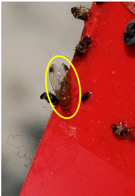
Picture 1. SWD adult male on red sticky trap, 5/23/22.