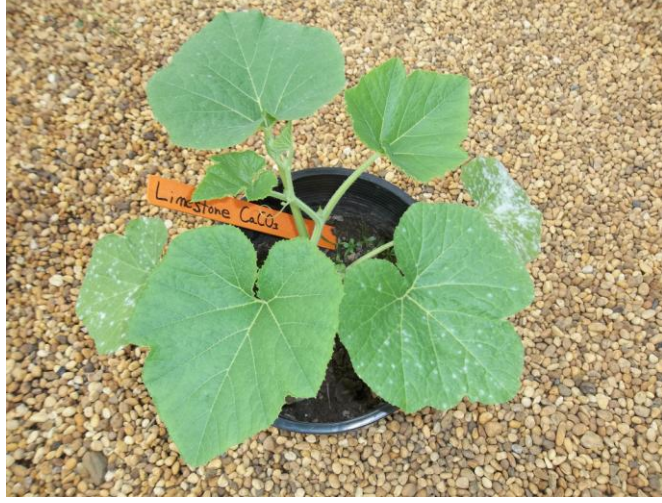
Calcium carbonate, limestone