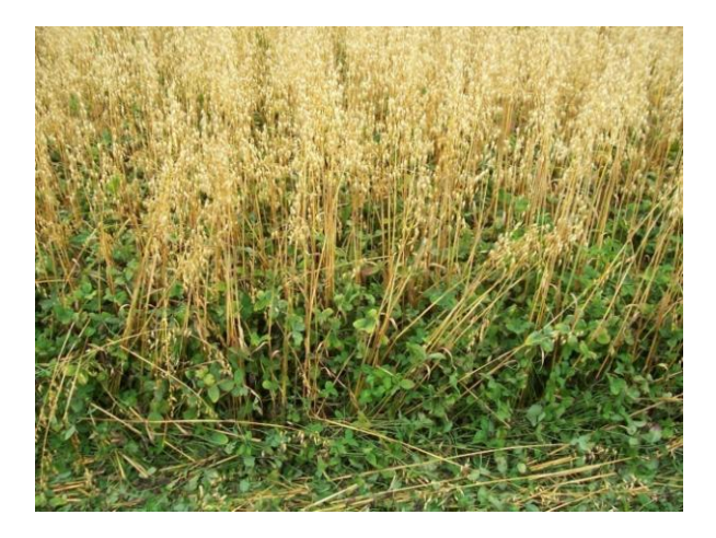
Red Clover and Orchard Grass Hay

In 2009, the same plots were seeded to oats without any additional carbonate or silicate application. Oats also served as a nurse crop to under seeded red clover and orchard grass. Grain yield averaged 48 Bu/acre for the calcium carbonate plots and 50 Bu/acre for the calcium silicate slag plots.