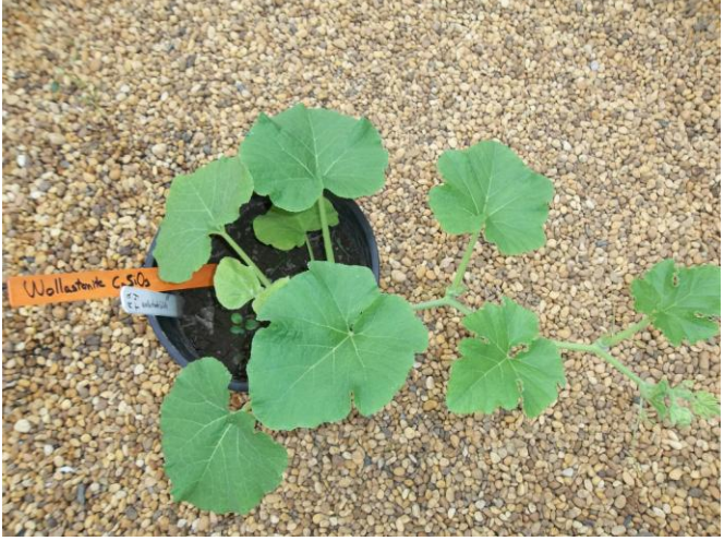
Wollastinite, natural calcium silicate