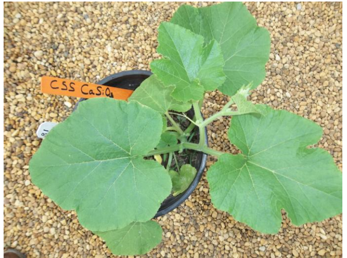
Calcium silicate slag, CSS, AgrowSil<sup>™</sup>