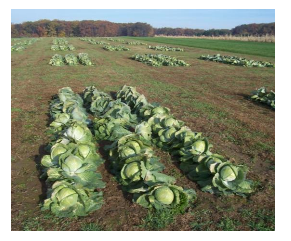
Greenhouse Studies on Silicon -Kentucky Bluegrass

In July 2011, cabbage was transplanted into the plots. Since the soil pH level was 6.5 for the amended plots, no additional calcium carbonate or calcium silicate slag applied. The soil pH = 5.5 in the no lime plots. Marketable cabbage head yields in tons per acre were 30.0 from the no lime plots, 31.5 from the calcium carbonate plots and 32.8 from the calcium silicate slag plots.