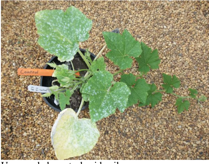
Unamended, control acid soil

A substantial body of local and international research trials shows that enhanced silicon soil fertility and nutrition helps to control powdery mildew disease on a wide variety of crops. The photos of pumpkin below illustrate the value of adding silicon to soil for suppression of powdery mildew disease.