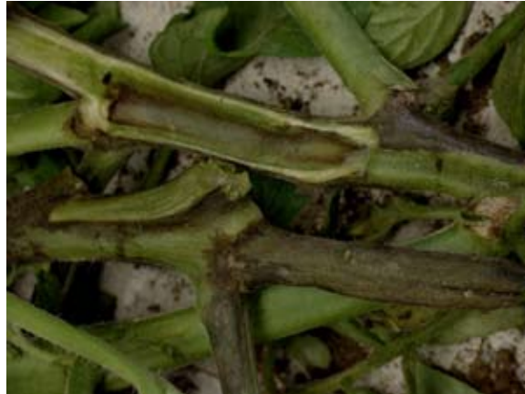
Symptoms of Stem/Pith Necrosis of tomato.