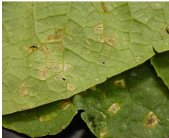
Symptoms of Angular leaf spot on top and bottom side of cucumber leaf.