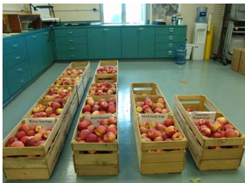
Early Fuji trial, Rutgers Snyder Farm 2005.