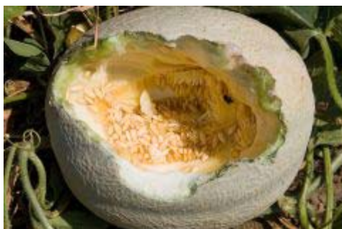
White-tailed deer feeding damage on melon, Springdale Farms, Cherry Hill, NJ.

The cost-share program will provide fencing material, plus up to 30 percent of the line posts at no cost to qualified farmers who were not awarded fencing in the 2004/2005 program.