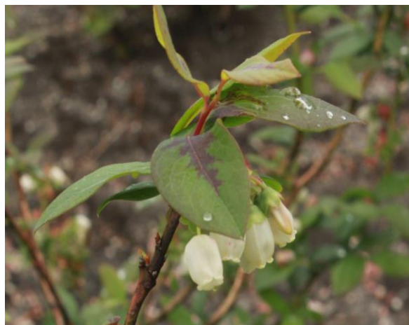
Primary mummy berry strike during 5/19-23

Mummy Berry: Some mummy berry primary strikes were seen in isolated locations. This should not be a problem with the low numbers of strikes we have seen.