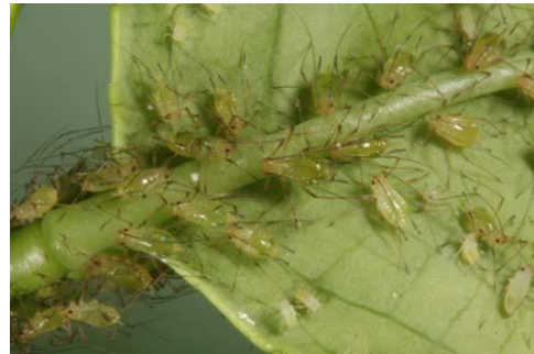
Aphids on blueberries

Aphids suck sap from tender growth and new shoots, especially from developing terminal foliage. Under heavy populations, a sooty mold can develop on the honey dew secreted by the aphids. This is usually of minor importance in blueberries, since growers seldom allow aphid populations to build up to high densities. Of more importance is the fact that many aphids function as disease vectors. In blueberries aphids can transmit blueberry scorch virus (BIScV) and its several strains.