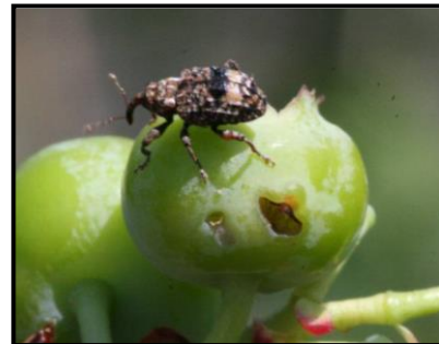
Adult plum curculio and the crescent-shaped scar on fruit caused during oviposition

Life Cycle. In New Jersey, PC completes a single generation a year in blueberries. This insect overwinters as an adult in leaf litter. Adults become active during bloom and feed on young fruit just after bloom, causing feeding scars. We have noticed that in the absence of fruit, PC adults feed on blueberry